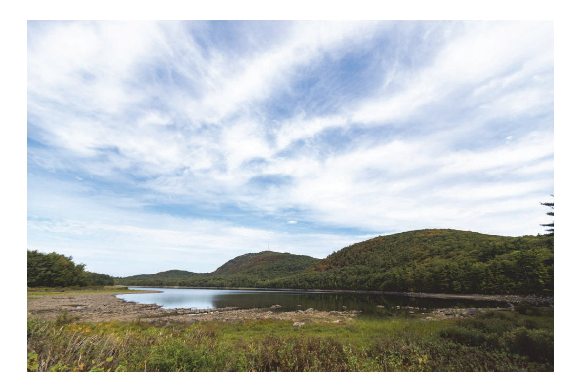
Maine Water • Biddeford & Saco Division Water System • Water Quality Report 2024