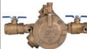
Reduced Pressure Device