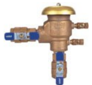
Pressure Vacuum Breaker